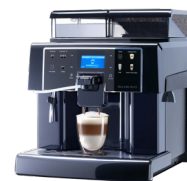
Aulika Evo Focus