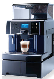
Aulika Evo Top